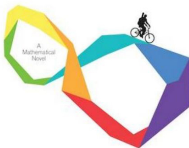
FIGURE 2. Möbius strip